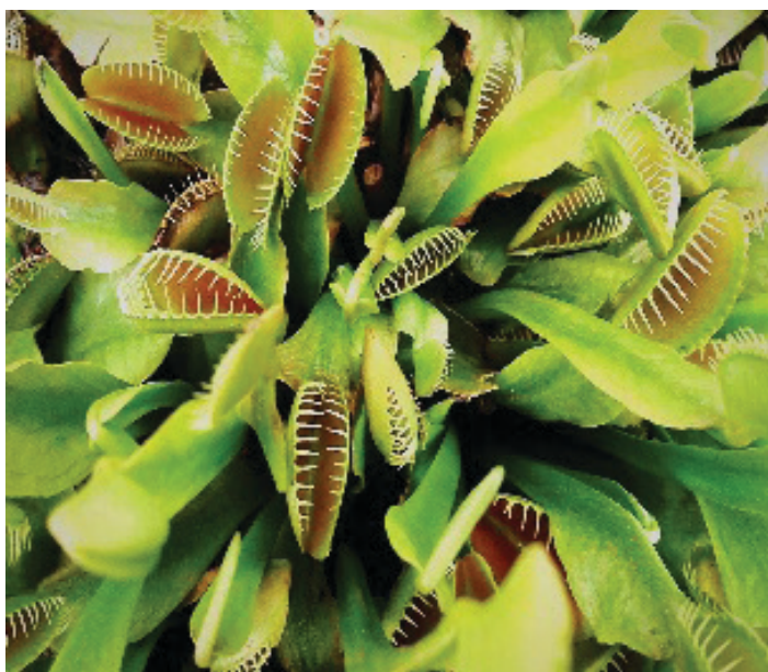
Venus Fly trap